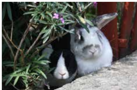
Inseparable Friends: Fozzie (on left) with Florrie.

Well, who can resist that? It made me want him a little bit more! He was a four-year-old Dutch rabbit called Paddy. The bond was instant: Florrie had picked her man. So Paddy came home! He seemed unsure of his surroundings at first, but