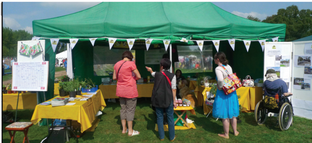
The Friends tent on Fun Day in August - recruiting new members, selling plants and preserves.